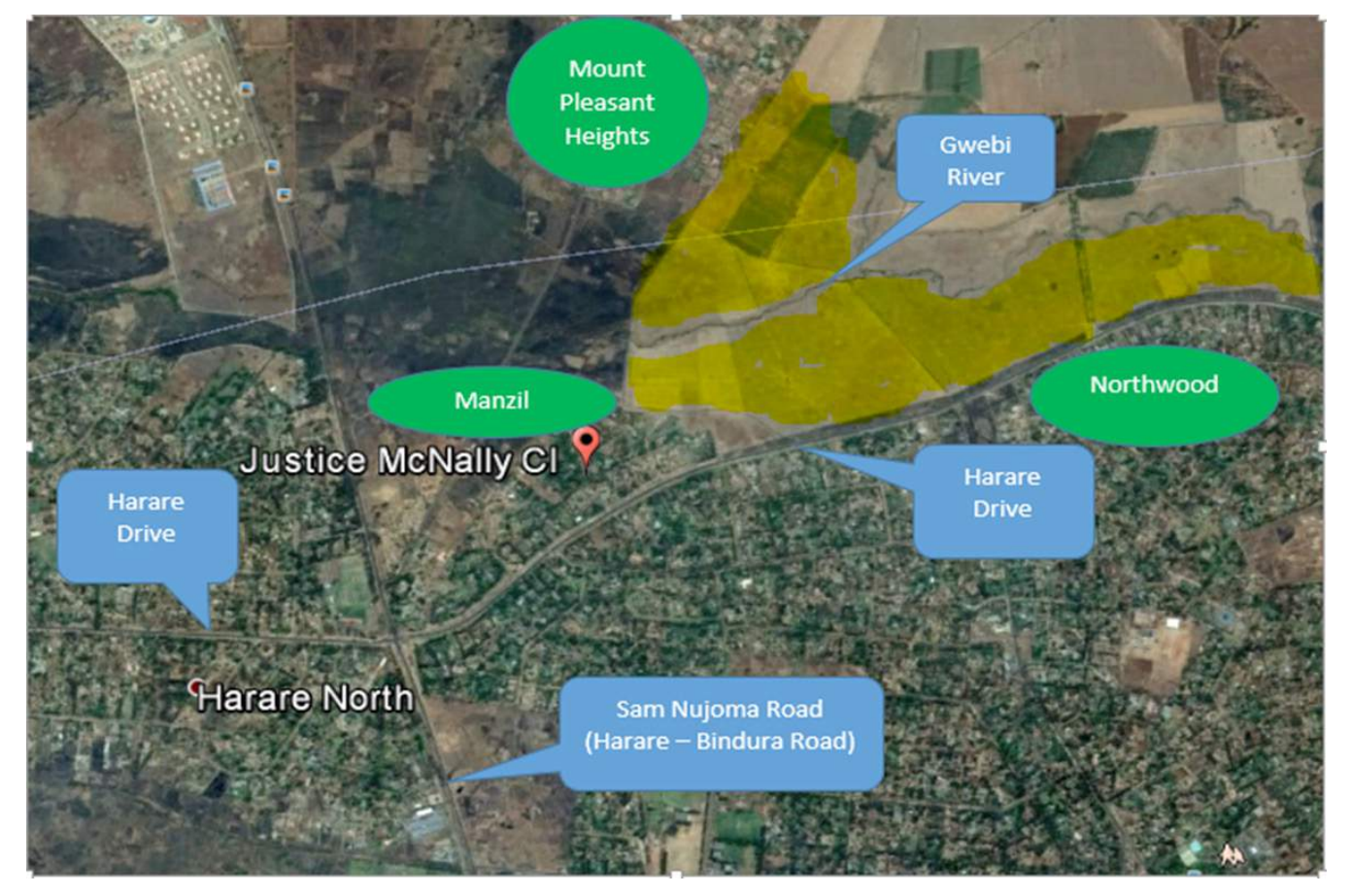
Figure 6 1Project Location Map

The nearest robot controlled intersection to the site is from two major distributor roads namely Sam Nujoma Road (Harare–Bindura Road) and Harare Drive. The initial subdivision layout design, which may be adopted for reapplication for the subdivision permit, provided for a single access and exit point into the proposed housing development from Harare Drive in order to reduce the number of potential traffic conflict points along the major distributor road.